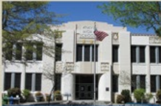
Analy High School