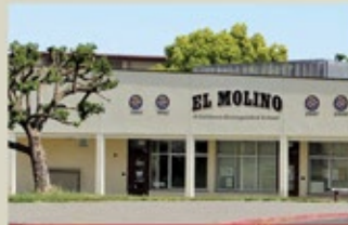
El Molino High School