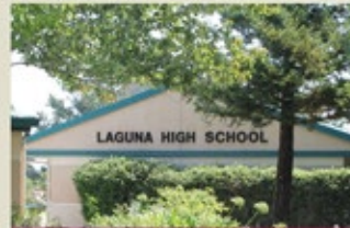
Laguna High School